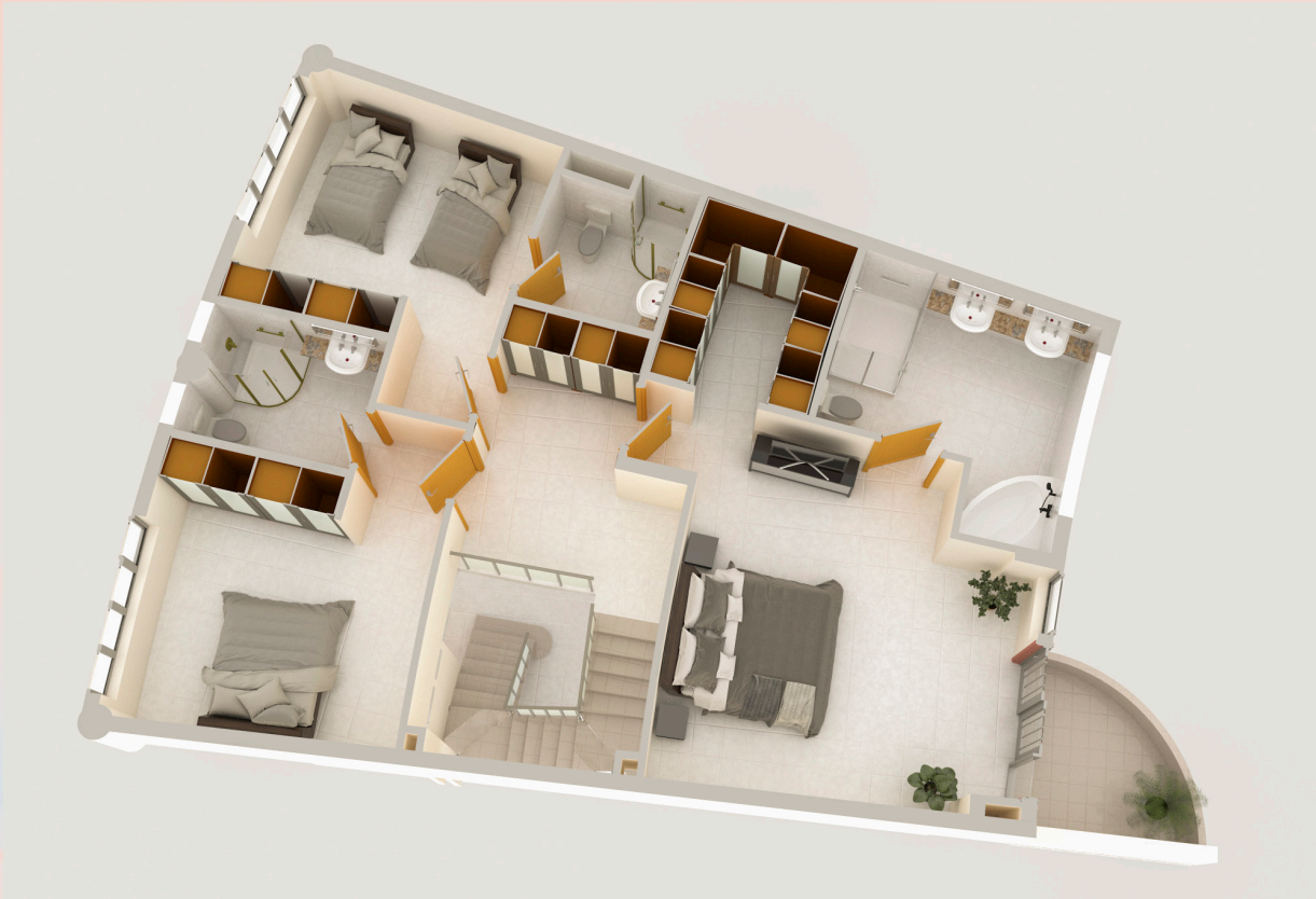
3 Bedroom Duplex First Floor