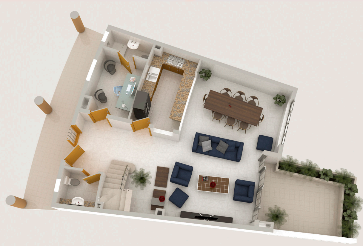
3 Bedroom Duplex Ground Floor