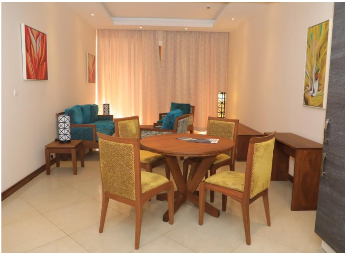
Typical Master bedroom